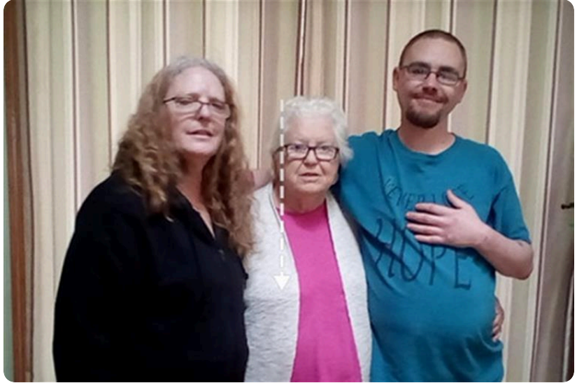
New Photo 1