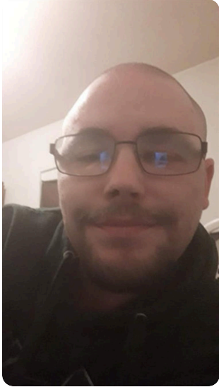
New Photo 1